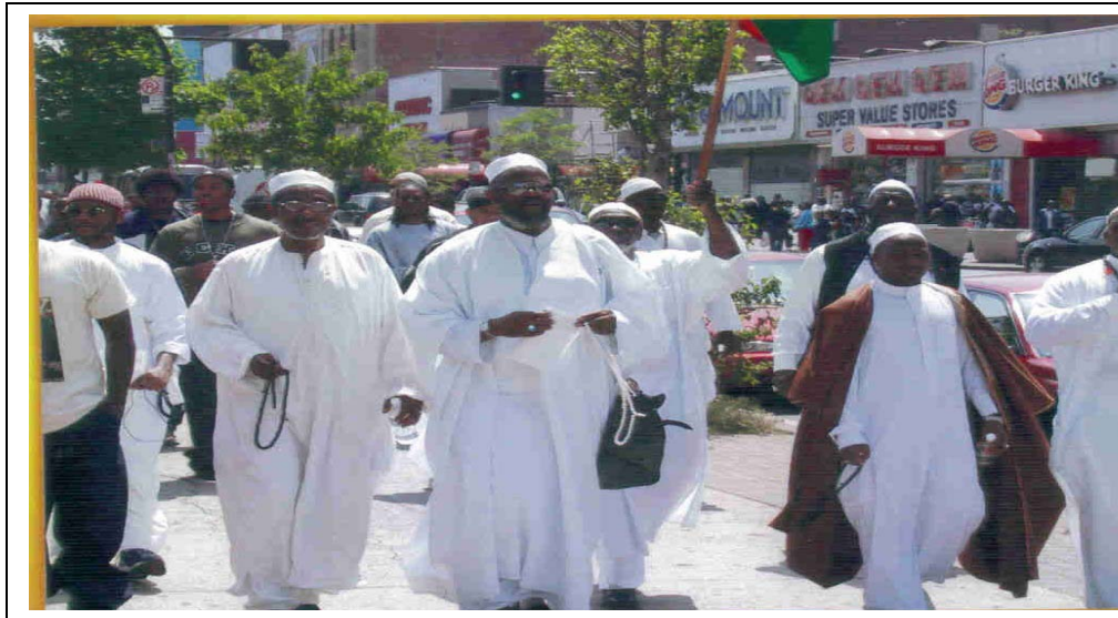
African American and continental African Muslims walk shoulder to shoulder through the streets of Harlem in 2001, honoring El-Hajj Malik/ Malcolm X