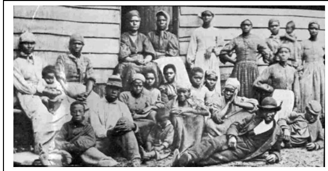
Captive African and African American families on Southern plantations often had Muslim women of Sene-Gambian origin as members