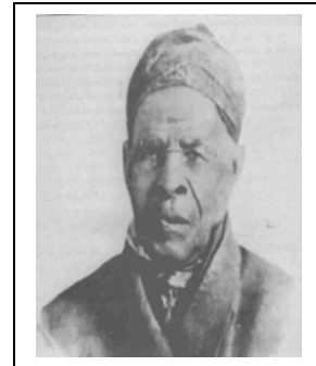
Umar Ibn Said was born in Futa Toro (Senegal), enslaved, and eventually lived in North Carolina